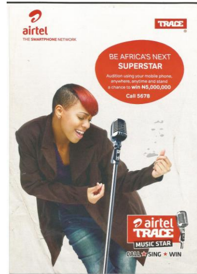
Plate 1. Influential Youth fashion Plate 1.1. Hair Style and T-Shirt with message Plate 1.2. Sponsorship ad. for Airtel and Trace