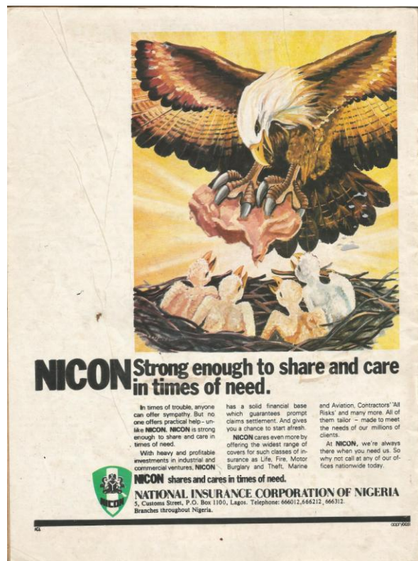
Plate 2 ACB Symbolic message – Design John Amifor Plate. 3 Nicon Symbolic and Institutional message—Design, Insight.